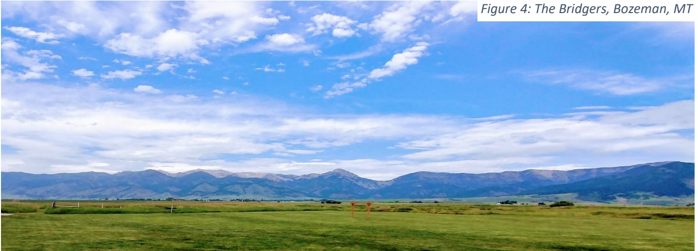
Figure 4: The Bridgers, Bozeman, MT

for trainees to be handed out at each training. We are always looking for suggestions as to how to further improve the clinic experience for everyone involved.