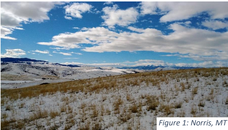
Figure 1: Norris, MT

Issue #2 of the Senior Defense Newsletter The Senior Financial Defense Grant is a project undertaken by the Legal Services Developer Program within Senior Long-Term Care. Its goal is to effectively address the needs of victims of financial exploitation in Montana, through victim services, enhanced reporting, training and education. This newsletter is going out to committee members, former trainees, and friends of the project. Whatever your role, we are thrilled to involve you in this important endeavor and welcome feedback and participation.