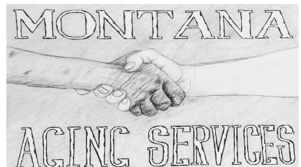
Figure 3: Aging Services Drawing, Katy's Office

2019 Trainings In conjunction with each clinic, the project also hosts a training the day before that covers topics such as assessing and working with clients with limited capacity,