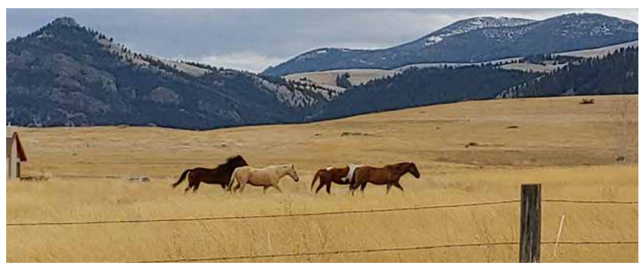
Horses in the foothills of Montana.

The primary responsibilities for the Director of the American Indian Health outlined in the Governor's Executive Order were developed with feedback from tribal government representatives.