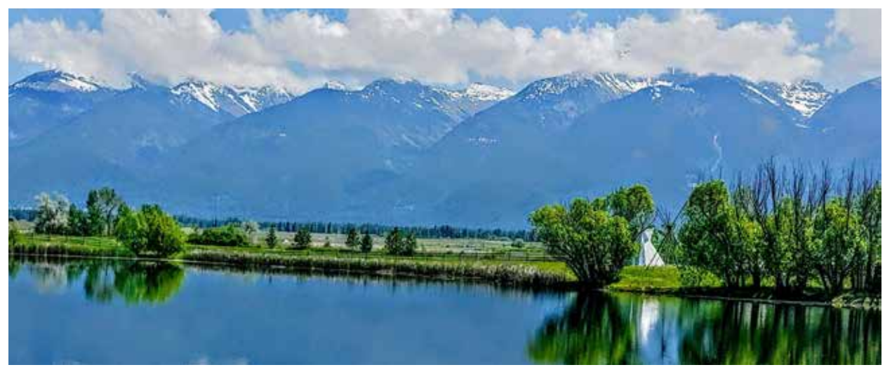
Ninepipes National Wildlife Refuge