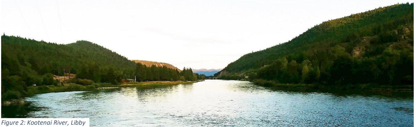
Figure 2: Kootenai River, Libby

The State of Affairs Unfortunately, it is when American needs help the most that the scammers choose to strike. After events like the recent hurricane which ravaged the eastern and southern shores of the US, scammers quickly set up fake charities, collecting money from well-intentioned seniors and young people alike. If you are going to donate to a charity, make sure you are donating to a legitimate one! Check URLs closely and use sites like