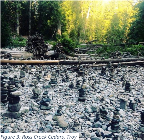
Figure 3: Ross Creek Cedars, Troy

The Senior Companion Program pairs volunteers, aged 60+, with home-bound senior clients. The companion helps with groceries, household chores, and transportation. They are on the front lines of senior abuse and exploitation and are a very responsive group to train.