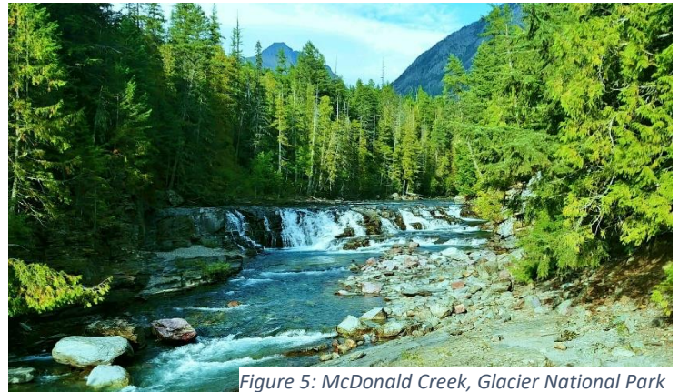
Figure 5: McDonald Creek, Glacier National Park