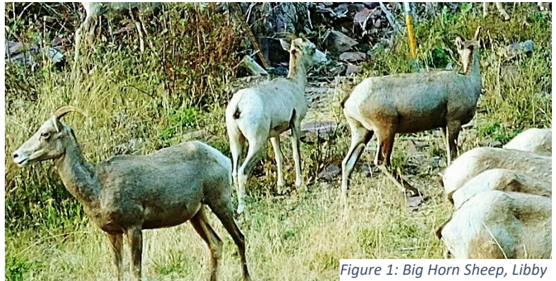
Figure 1: Big Horn Sheep, Libby

The Senior Financial Defense Grant is a project undertaken by the Legal Services Developer Program within the Senior and Long-Term Care Division at the state of Montana. Its goal is to effectively address the needs of victims of financial exploitation in Montana, through victim services, enhanced reporting, training, and education. This newsletter is going out to committee members, former trainees, and friends of the project. Whatever your role, we are thrilled to involve you in this important endeavor and welcome your feedback and participation.