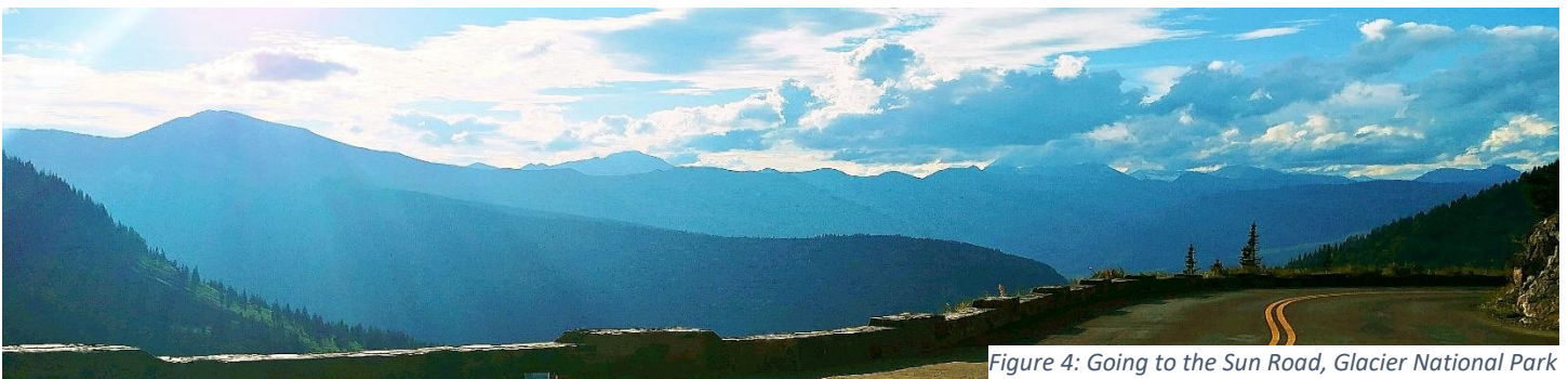
Figure 4: Going to the Sun Road, Glacier National Park

Billings will be our last and largest clinic of 2019; in fact, Billings will be our first ever 2-day clinic. Our Capacity, Exploitation, and Reporting training will be held on October 22 nd , with the