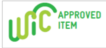
Example of generic shelf tags the State WIC Office will provide upon request

If a store chooses to use shelf tags, they must be placed on all WIC items in the store. The State Office will provide generic shelf tags to stores upon request. Stores may also develop their own shelf tags and submit the design to the State Office for approval before use. Retailers can contact Glade Roos groos@mt.gov or (406) 444-2841 to order a new set of shelf tags.