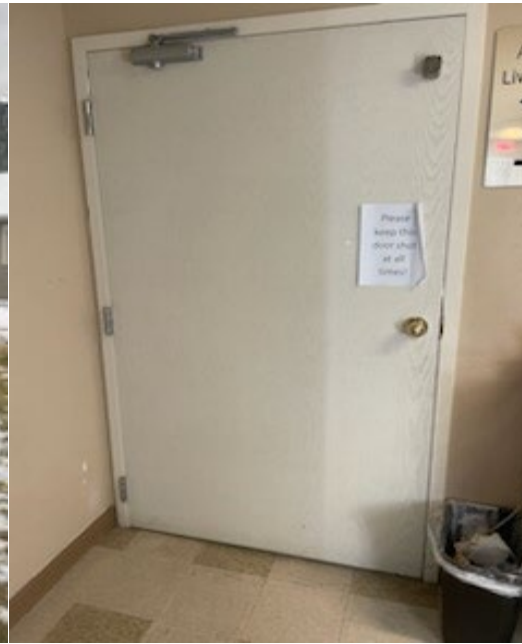
Locked staff door to Skilled Nursing Facility