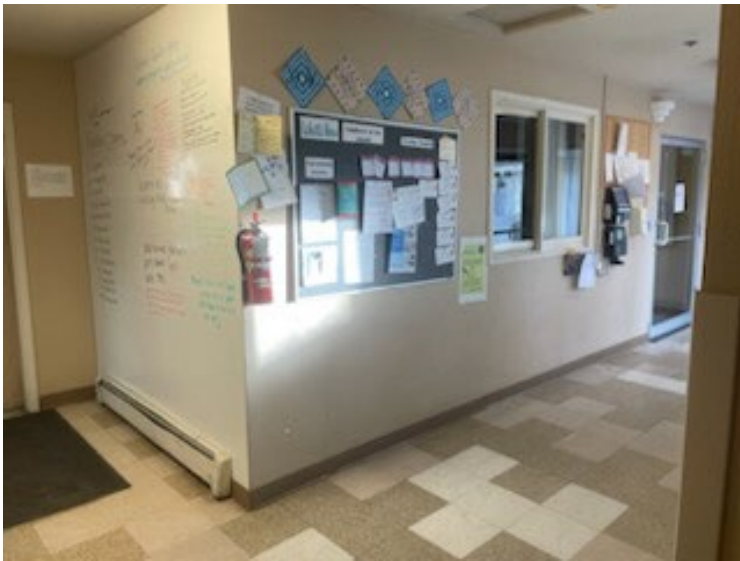
Locked staff room with information