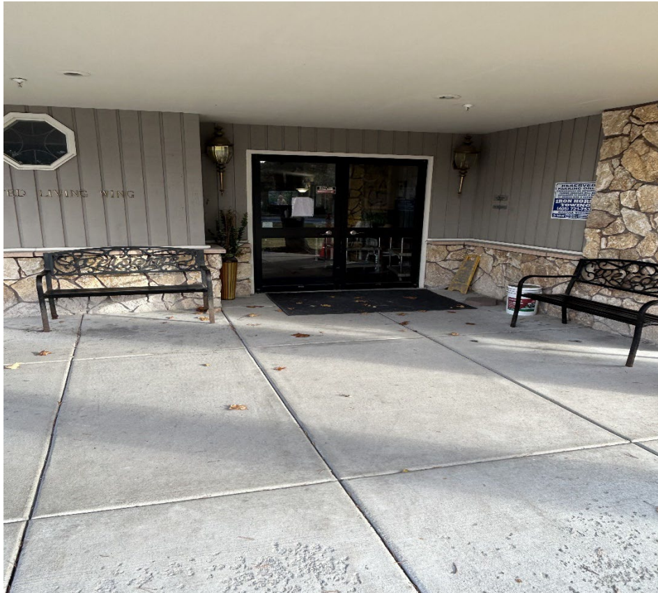
Main Front Entrance to Assisted Living Facility