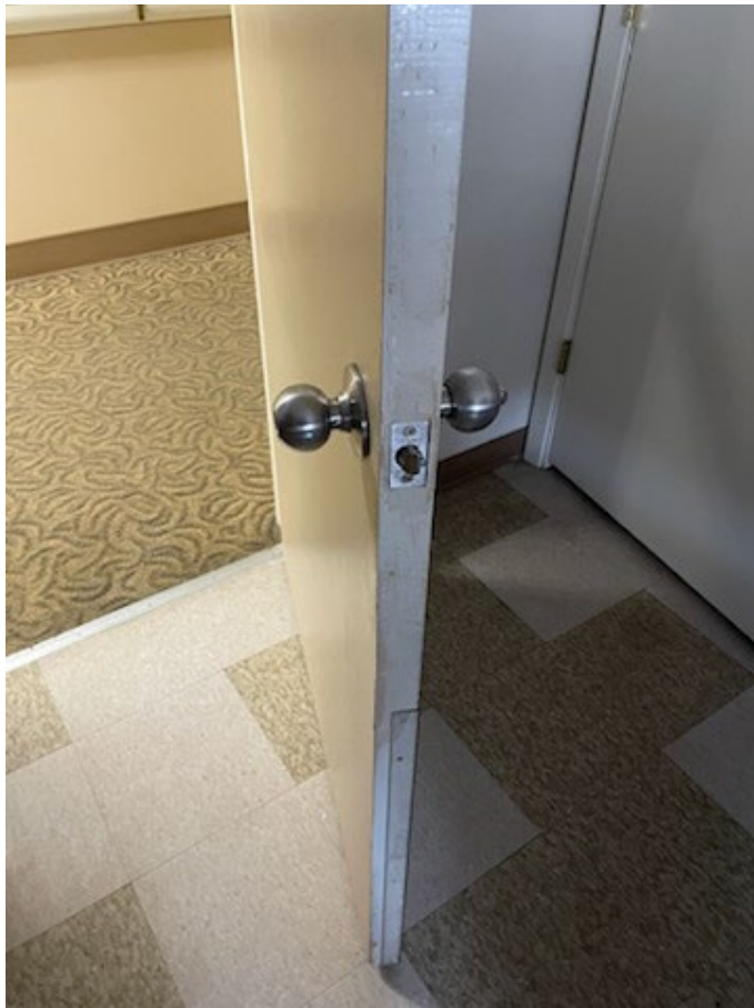
Resident door with lock