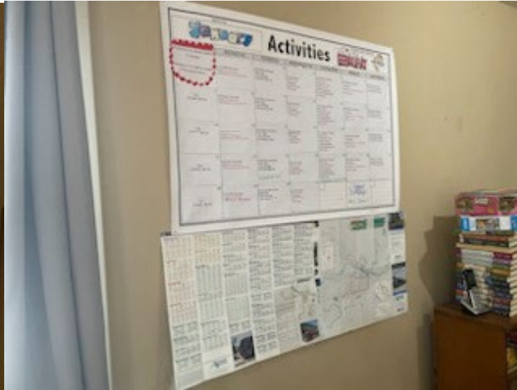
Activity board for residents