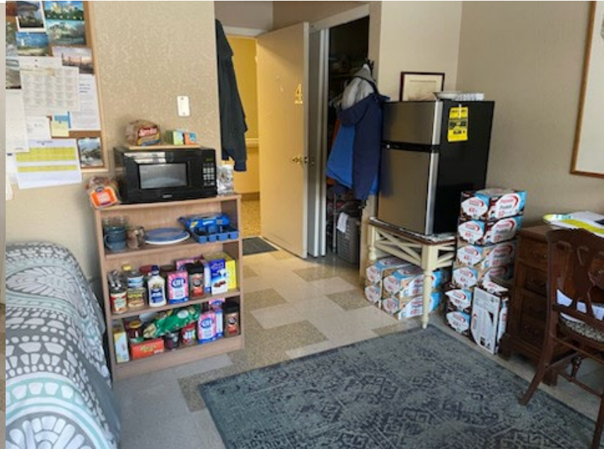
Resident area for storage