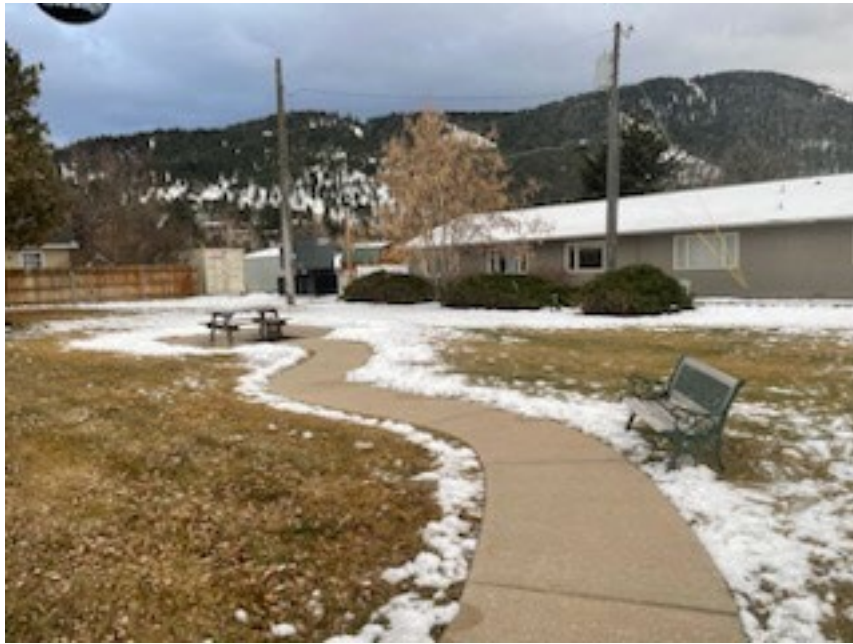
Assisted Living Facility Resident Courtyard